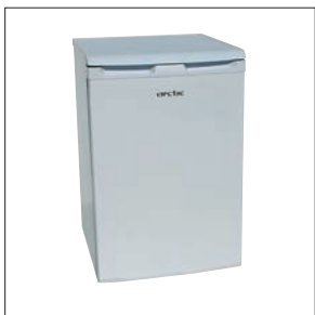
Racitor (140 l) Cod 025 010 070 010 (55 x 61 x 84 cm)