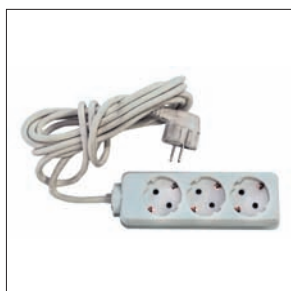
Prelungitor 230V, 10A, 3m Cod 019.010.277.000