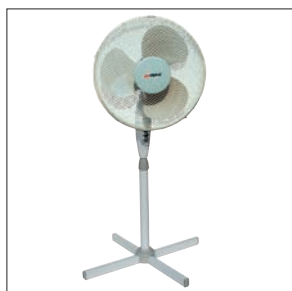
Ventilator cu picior Cod 025.010.500.020