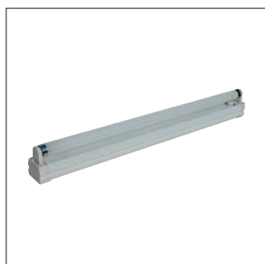
Corp fluorescent tip SS30 cu un tub D-170 - A Cod 019.010.190.001