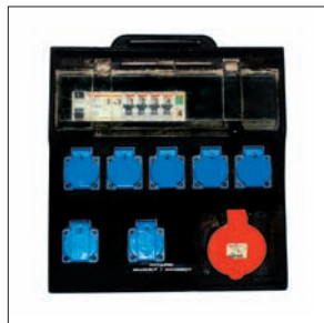
Panou Electric 380V/220V Cod 019.010.265.000