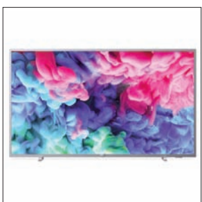
TV LED SMART 4K, UHD ultrasubtire (diagonala ecran: 126 cm) Cod 025 010 130 045