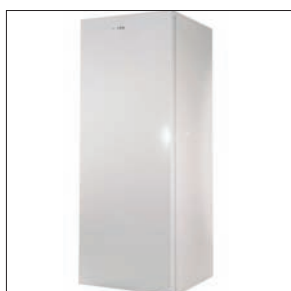
Frigider ARCTIC 255 l Cod 025 010 020 199