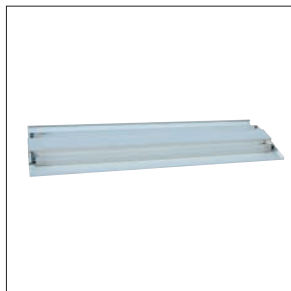
Corp fluorescent tip OCTANORM cu doua tuburi D-171 Cod 019.010.200.000