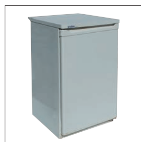
Frigider ARCTIC (180 l) Cod 025 010 070 020