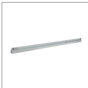
Lampa fluorescenta FIA cu instalatie electrica completa 1x40W Cod 019.010.110.000