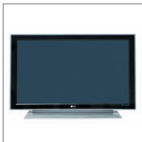
TV Plasma (diagonala ecran: 107 cm) Cod 025 010 130 040