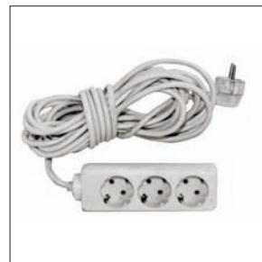
Prelungitor 230V, 10A, 5m Cod 019.010.279.000