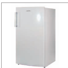
Frigider ARCTIC FB 155 Cod 025 010 020 198