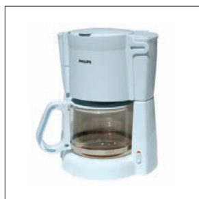
Filtru de cafea Cod 025.010.120.010