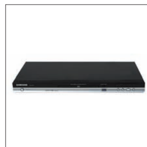
DVD Player Cod 025 010 130 030