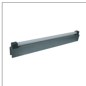
Corp fluorescent tip SS30 cu un tub D-170 Cod 019.010.190.000