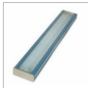
Corp fluorescent tip SYMA STAR Cod 019.010.200.001