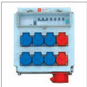
Panou Electric OCTANORM Cod 019.010.275.000