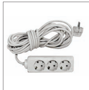
Prelungitor 230V, 10A, 5m Cod 019.010.279.000