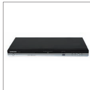
DVD Player Cod 025 010 130 030