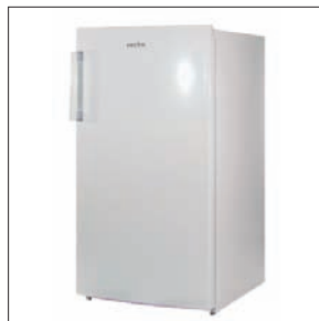
Frigider ARCTIC FB 155 Cod 025 010 020 198